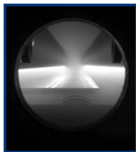
Magnetron Sputtered Process